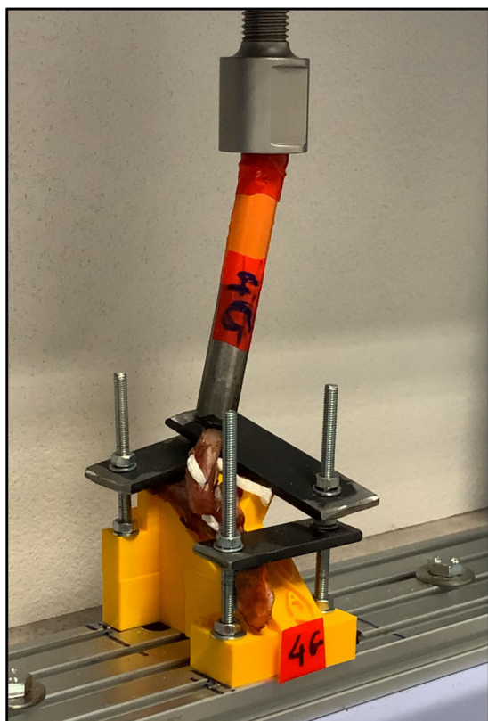
Figure 2. Biomechanical setup for stabilized hip with an UHMWPE implant before compression test.

load was applied to reach 10 N before starting the compression test to failure at 100 mm/min, in order to reproduce coxofemoral luxation (Flynn et al. 1994).